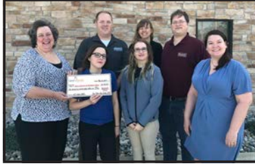
Your Credit Union matched the money earned from our team at the Annual Lapper Walk!