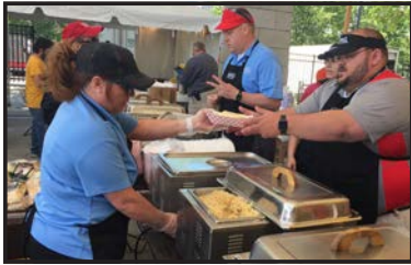
Serving up lunch to the hungry masses at Fort Wayne's Germanfest. Looks tasty!