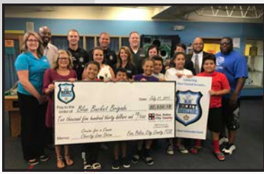
Thank you to everyone involved in our Cruise for a Cause charity loan event.