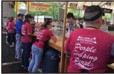
Celebrating the philosophy of "People Helping People" at Germanfest.