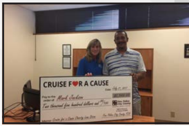
Congratulations to our lucky Cruise for a Cause contest winner!