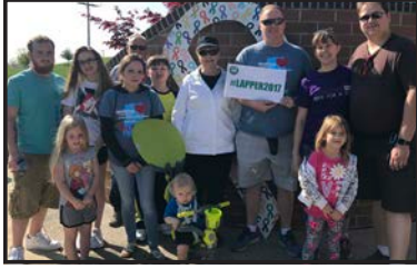
We're proud of all our employees who walked in support of the annual Lapper Walk.